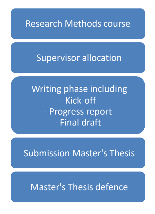
Figure 1: Overview of the Master's Thesis process and milestones

The Master's Thesis project involves different steps and milestones as summarized in Figure 1.