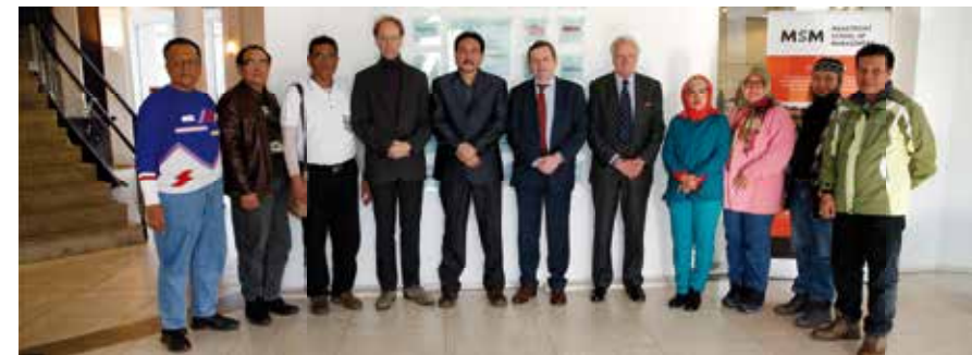
Medan Polytechnic (POLMED) delegation, Indonesia, at MSM

MSM plans to offer an exciting new MBA program with a focus on Agribusiness in Mongolia. Thanks to a recent agreement MSM will cooperate in this initiative with the Mongolian Business Development Agency (MBDA) in Ulaanbaatar, Mongolia.